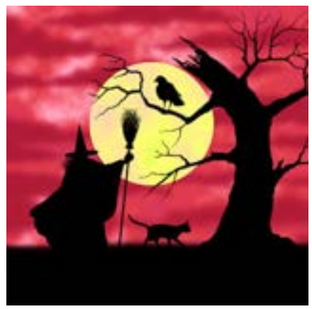
Trick-or-Treat Hours October 31 2:00 – 7:00 p.m.

Halloween Boo Bash October 29 4 - 8 p.m. – Pole Hill Park