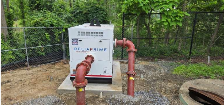
Left - New Berlin Road Gorman Rupp natural gas bypass pump station.